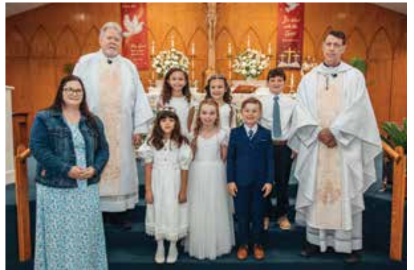
FIRST HOLY COMMUNION, ST MARTIN CHURCH, LECOMPTE. First Communion was held on Sunday, May 3.