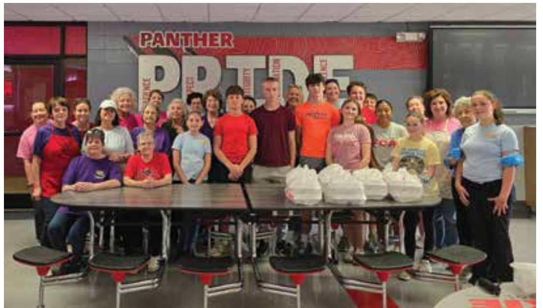
CHILDREN OF MARY, ST. ANTHONY OF PADUA CHURCH, BUNKIE. The Children of Mary congregation of St. Anthony in Bunkie, participated in preparing and distributing spaghetti plate dinners for the Catholic Daughters, Court Saint Anthony #968 of Bunkie.