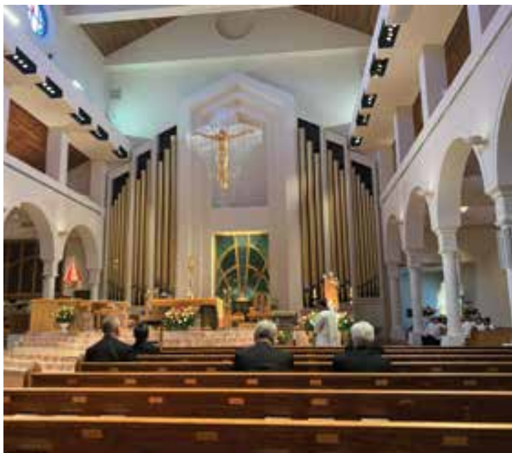
(left) BISHOP SHARES PHOTOS FROM HIS TIME IN ORLANDO ATTENDING BISHOPS MEETING. "Inside the Basilica of the National Shrine of Mary, Queen of the Universe, anticipating Exhibition and Adoration of the Blessed Sacrament prior to the Mass of Consecration of the United States of America to the Most Sacred Heart of Jesus."