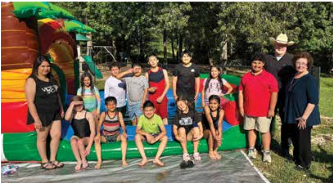
OUR LADY OF LOURDES CCD CLASSES. End of catechism classes for the summer break was celebrated with an outdoor fun day at OLL, Winfield.