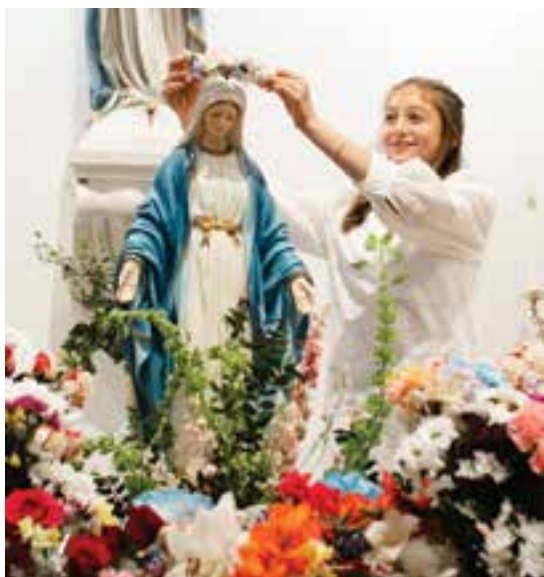
MAY CROWNING, ST. ANTHONY SCHOOL AND CHURCH, BUNKIE. On May 13, the student body of St. Anthony School in Bunkie processed to the Church. All of the students held flowers for Mary.