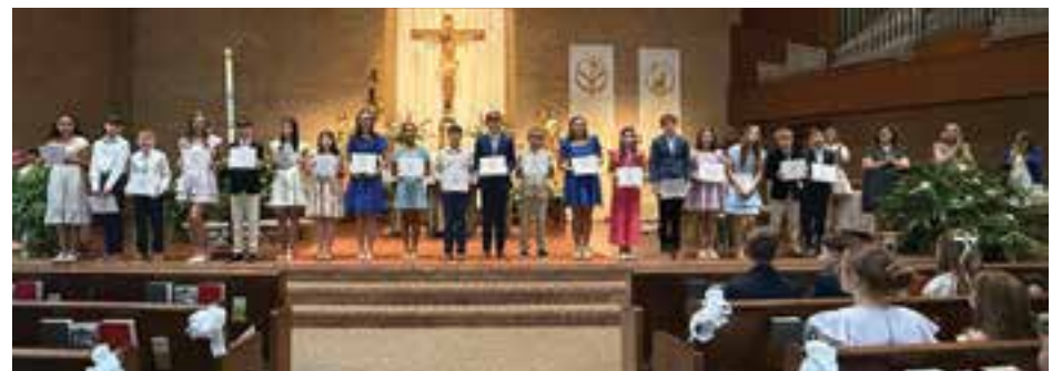
OUR LADY OF PROMPT SUCCOR SCHOOL'S 6TH GRADE FAREWELL. The students in 6A and 6B at OLPS said farewell to elementary school and are ready to move on to junior high school next year.