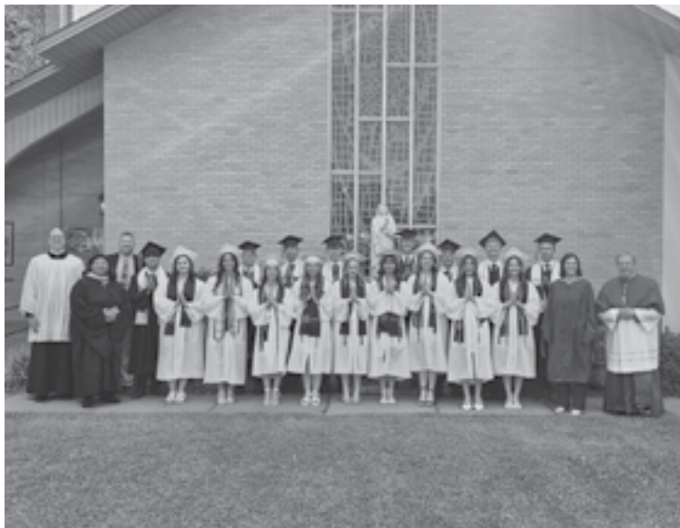
ST. JOSEPH SCHOOL, PLOUCHEVILLE. 2026 Graduating Seniors pose for a group photo prior to graduation ceremonies held on May 15.