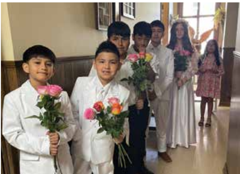
MAY CROWNING, OUR LADY OF LOURDES CHURCH, WINFIELD. Children of OLL parish celebrated May Crowning.