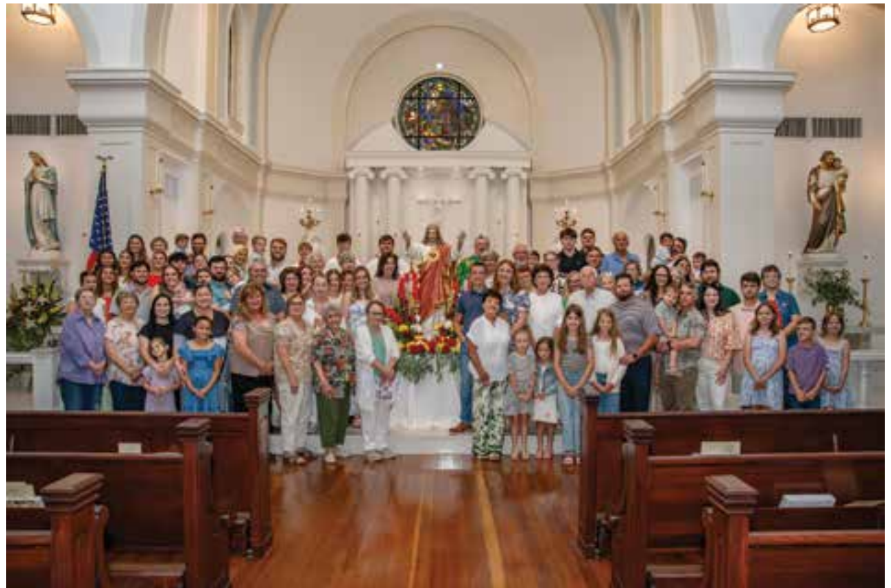
(above and right) CONSECRATION OF THE UNITED STATES TO THE SACRED HEART OF JESUS. Parishioners at Saint Anthony Parish in Bunkie are shown gathered around the statue of the Sacred Heart of Jesus. In keeping with Catholics throughout the nation, the congregation prayed the Consecration of the United States to the Sacred Heart of Jesus at all Masses on the weekend of June 13-14. The statue is the oldest in the parish, having been purchased for the first Catholic chapel built in Bunkie shortly after 1900.