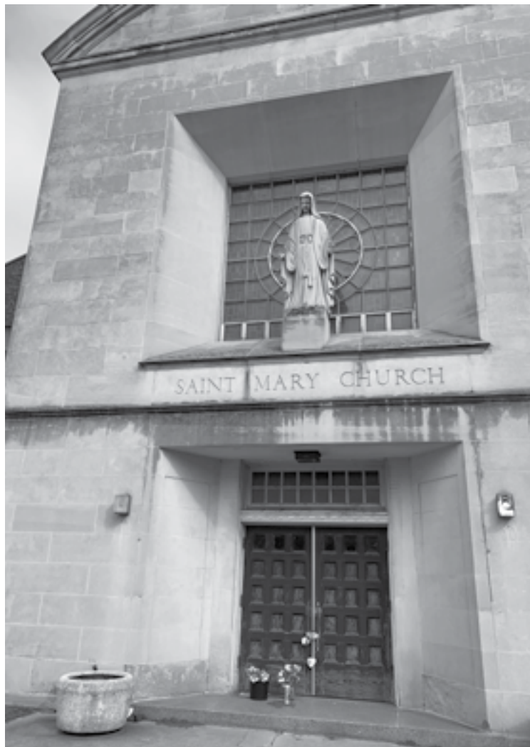
SAINT MARY OF THE ASSUMPTION CHURCH, DOLTON, ILLINOIS. This was the parish church and school of Robert Francis Prevost, now Pope Leo XIV. The parish was merged with a neighboring parish in 2011 and the campus remains abandoned.

Confirmation, and – eventually – his ordination as a deacon and a priest of the Augustinian order. If the register was still being meticulously kept, it might have also recorded that he was ordained a bishop in 2014, three years after his home parish had been closed. Today, I suspect, that record has certainly been amended to include a notation of the election on May 8, 2025, of Robert Francis Prevost as Bishop of Rome and Vicar of Christ who assumed the name of Leo XIV.