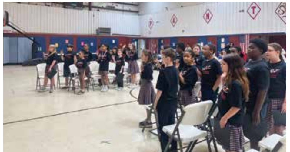
DARE GRADUATION. St. Frances Cabrini School's D.A.R.E. Graduation was held on May 11 for 5th grade students.