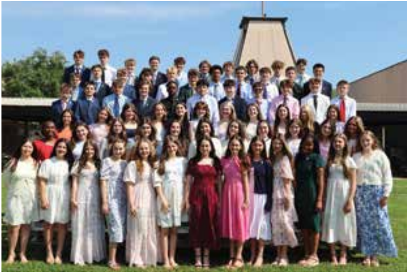
HOLY SAVIOR MENARD JUNIOR HIGH 8th Grade posed for an end of school group photo.