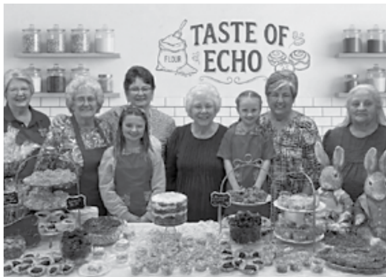
TASTE OF ECHO. This year, the talented parishioners of St. Francis DeSales Catholic Church truly outdid themselves. Guests were treated to an impressive spread of 18 unique offerings, including savory main dish samples, hors d'oeuvres, and decadent desserts. Thank you to everyone who cooked, sampled, and donated to make this event a highlight of the season!