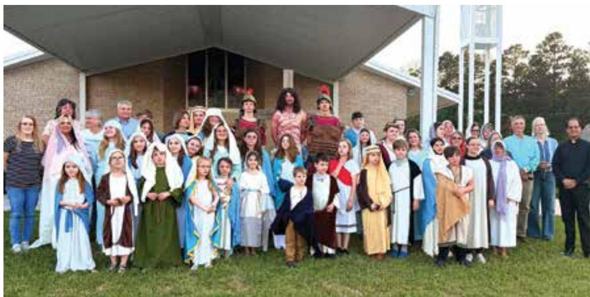
ST. JOHN THE BAPTIST CHURCH, DEVILLE. Live Stations of the Cross from the CCD children.