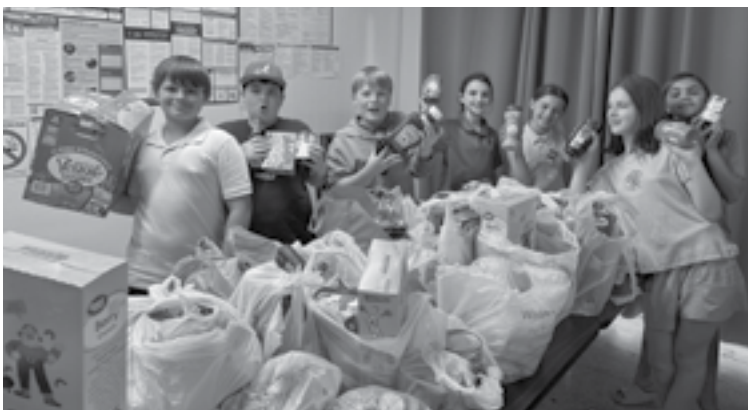
ST. JOSEPH CCD AND ST. JOSEPH ALTAR SOCIETY (MARKSVILLE) partnered during Lent to collect non-perishable food items to fill St. Joseph's food pantry. CCD students helped to organize the items and restock the shelves. We are grateful for the donations given to this wonderful project.