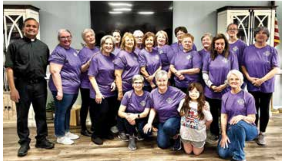
THE LADIES OF IMMACULATE CONCEPTION TEAM at Immaculate Conception Church, Dupont hosted an ice cream sundae party and bingo for the residents of Avoyelles Manor Nursing home.