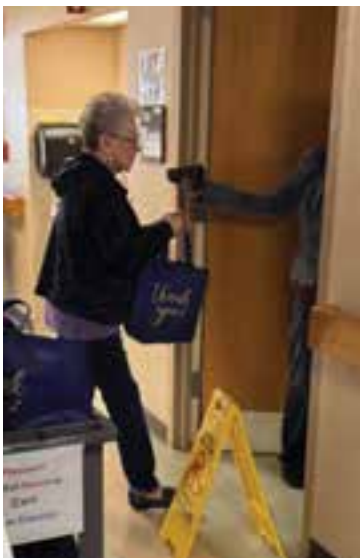
Promoting Healthy Hygiene Among Elderly Veterans: This project involved providing hygiene toolkits to elderly veterans at the VA Community Living Center in Pineville. The toolkits included essential items such as toothpaste, toothbrush, dental floss, denture cups, denture cleanser, deodorant, lotions, Vaseline, and bottle soap. On March 28, they delivered 22 toolkits to veterans located in the CLC. The veterans were so grateful for their hygiene products.