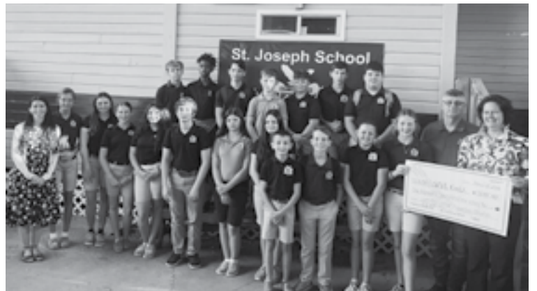
MATER DOLOROSA, PLAUCHEVILLE. On March 19, Mater Dolorosa AHFI Youth Group had a bake sale for their March Mercy Mondays in order to raise money for Save Cenla. Their bake sale raised $733 plus a donation from PTO. They were able to present Save Cenla with a donation total of $1,209.