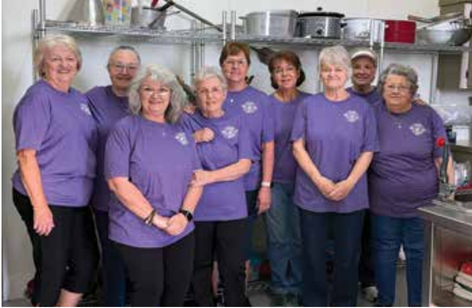
SEASON OF SERVICE WITH THE CATHOLIC DAUGHTERS OF ST. JOSEPH IN MARKSVILLE. The Van Der Putten Catholic Daughters Court #2029 prayed for priests, deacons and vocations during weekly adoration and cleaned and organized the prep room/kitchen at the St. Joseph church hall!