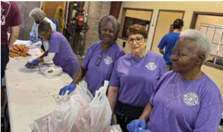
(above and below) ST. JAMES HIGH ENERGY SERVERS, ST. JAMES MEMORIAL CHURCH, ALEXANDRIA. Supporting Food Insecurity Needs at the Cenla Food Bank: This project focused on providing team services to assist with the preparation of Senior Food boxes and the Backpack program for school-age children. On April 1, the youth joined in the service preparation for the Senior Food boxes.