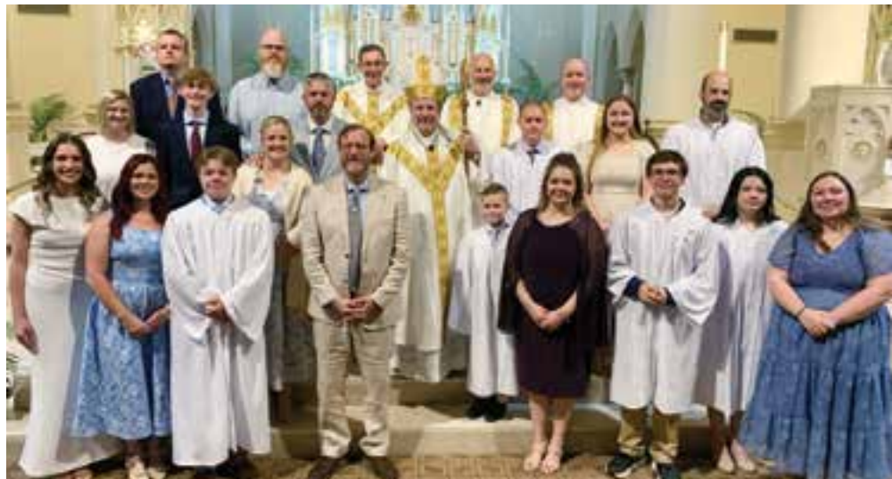
ST. FRANCIS XAVIER CATHEDRAL. It was a beautiful Easter Vigil at St. Francis Xavier Cathedral in spite of the rain that made the Blessing of the Fire more subdued. 20 parishioners received one or more of the Sacraments of Initiation on this Holy Saturday.

“Do not abandon yourselves to despair: We are the Easter people, and Hallelujah is our song.”