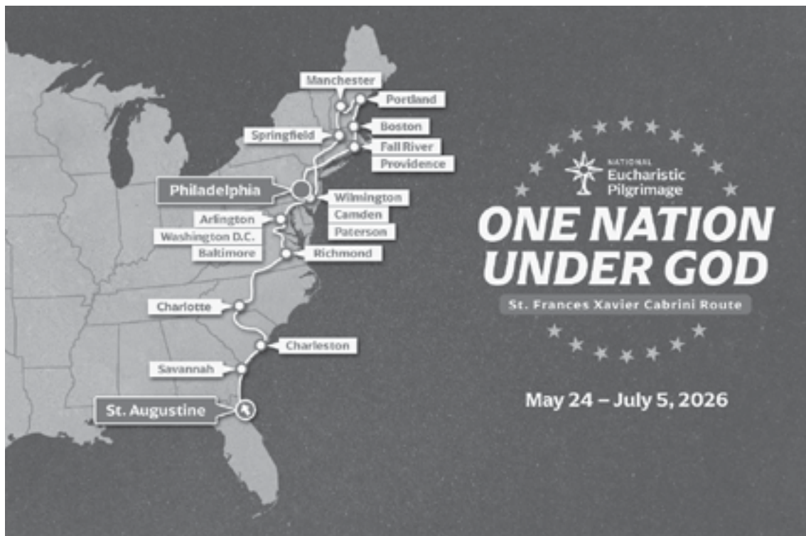
NATIONAL EUCHARISTIC CONGRESS PILGRIMAGE. A graphic depicts the 2026 route of the National Eucharistic Pilgrimage, which begins May 24 in St. Augustine, Fla., and ends in Philadelphia July 5. On March 18, 2026, pilgrimage organizers announced diocesan details and registration opportunities for public stops along route.

The organization did not specifically reference the U.S.-Israel war on Iran, throughout