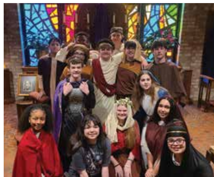
ST. FRANCES CABRINI SCHOOL. On April 2, the 8th Grade class performed a Living Stations of the Cross.