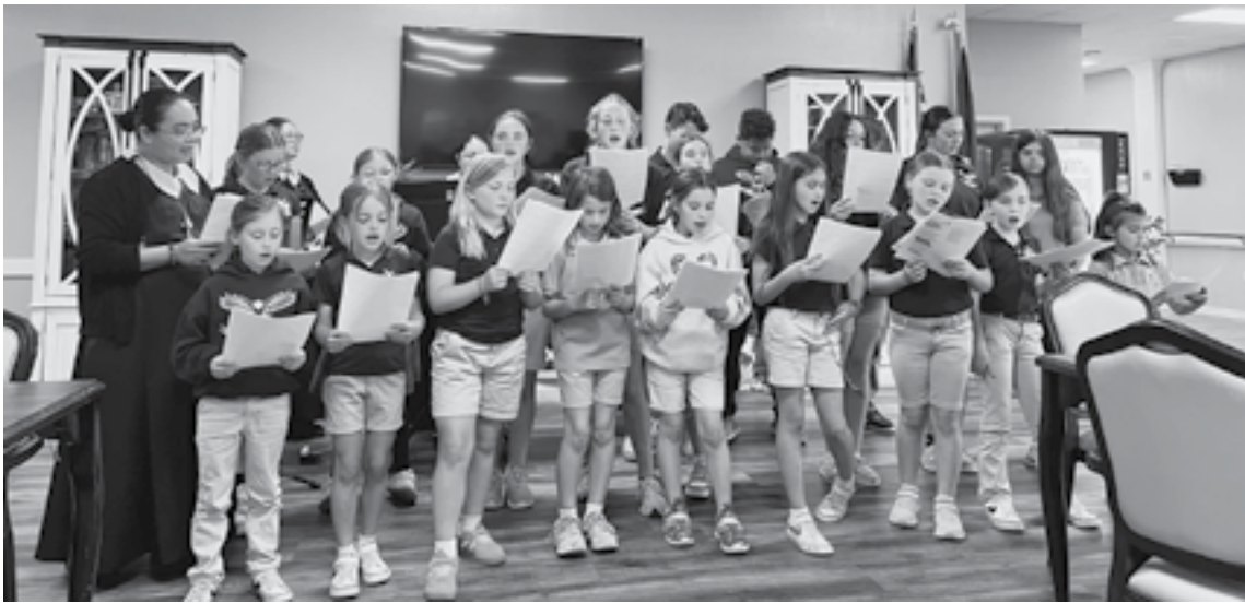
AHFI YOUTH GROUP OF MATER DOLOROSA AND ST. JOSEPH'S SCHOOL, PLAUCHEVILLE. On March 23, the kids visited Avoyelles Manor Nursing Home for their March Mercy Mondays (above). They were joined by the children's choir. Together they prayed the rosary and sang with the residents.

(below) On March 16, AHFI Youth Group of Mater Dolorosa and St. Joseph's School spent the afternoon cleaning statues around the school and Church grounds as part of their March Mercy Mondays acts of service during this Lenten season.