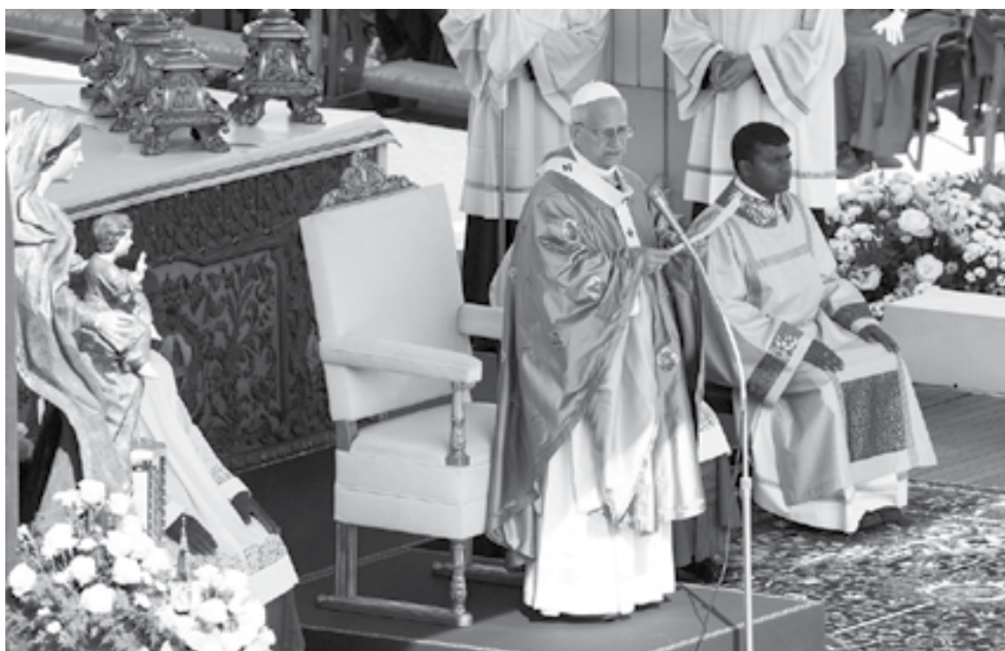
NEWLY CANONIZED. Pope Leo XIV pronounces the homily during the canonization Mass of St. Carlo Acutis, a British-born Italian boy who became the first millennial to be made a Catholic saint, and St. Pier Giorgio Frassati, in St. Peter's Square at the Vatican, Sept. 7, 2025.

"While the celebration is very solemn, it is also a day of great joy, and I wanted to greet especially the many young people who have come for this holy Mass," he said, also greeting the families of the soon-to-be