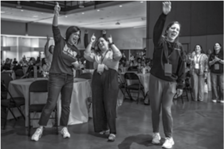
THE SPIRIT OF GENESIS OF EVE. Capturing the joy in a moment during the women's conference held Sept. 12-14 in Alexandria.