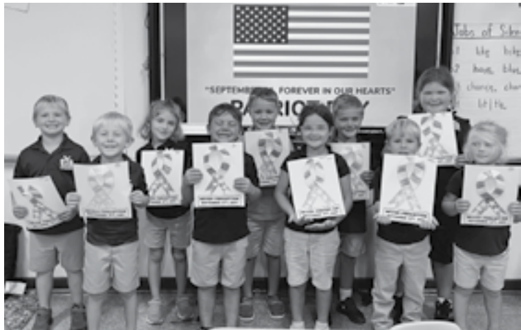
ST. JOSEPH ELEMENTARY SCHOOL, PLAUCHEVILLE. The students had the honor of watching the 9/11 Parade as it passed by the school. With flags waving, they stood together in remembrance of those lost, in gratitude for our first responders, and in prayer for our country. In the classroom, students reflected on the events of September 11th through lessons, discussions, and activities designed to help them understand the importance of unity, sacrifice, and faith during difficult times.

A lucky winner is chosen for a daily cash prize starting Oct. 1st through Oct. 30th! Each ticket has 30 chances to win over $20,000 in cash! Winning tickets are returned to the drawing every day. Tickets purchased once the drawings begin are only eligible for the remaining drawings. Winners are chosen LIVE on Facebook by students or a video is posted each day at 2 PM. Tune in for the fun! Tickets are $55 and must be purchased on www.OLPSCampusCountdown.com .