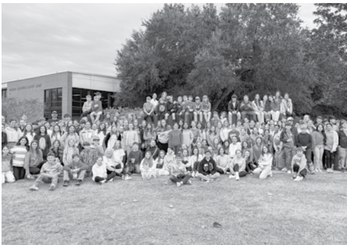
BEYOND THE LIMITS YOUTH CONFERENCE. Over 200 middle schoolers attended the 2024 Beyond the Limits Jr. High Conference (above). Registration is now open for 2025 Beyond the Limits to be held Dec. 6 at the Alexandria Convention Center at 2225 N. MacArthur Drive in Alexandria.

And it's precisely in this tender, searching season that the