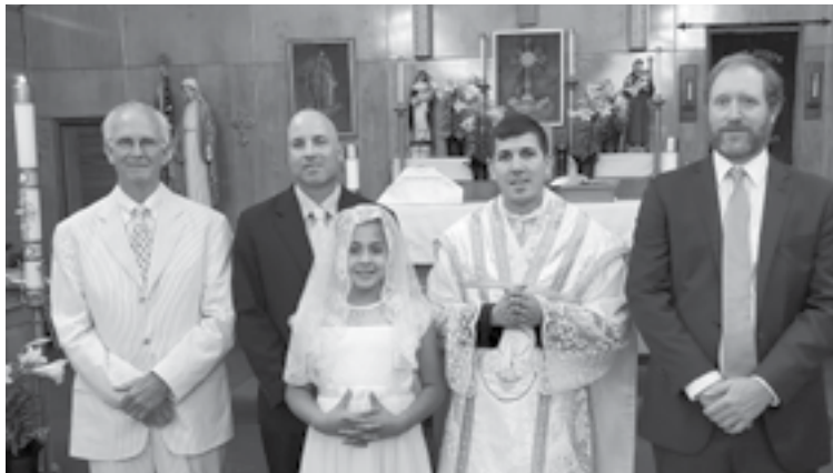
ST. JOSEPH CHURCH IN ST. JOSEPH, LA, received four into the church during Easter Vigil Mass.