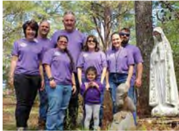
SOS TEAM MADE UP OF MEMBERS FROM 3 DIFFERENT CHURCH PARISHES (St. Joseph, Marksville; Our Lady of Lourdes, Fifth Ward; St. Francis de Sales, Echo). Projects included washing windows at Maryhill Renewal Center; cleaning the flower beds at Our Lady of Lourdes Catholic Church in Fifth Ward and power washing the sidewalks in front of the rectory at St. Joseph Catholic Church in Marksville.