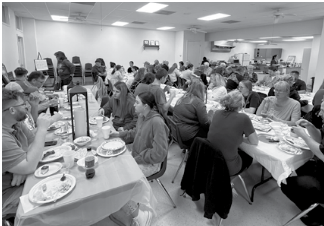
ST. EDWARD MISSION CHURCH IN FISHVILLE hosted a Seder Meal so that people could experience the connection between the Passover and the Last Supper on Wednesday of Holy Week. Roast lamb, unleavened bread, wine and bitter herbs were served as part of this Jewish traditional meal which is associated with Passover.

rude,” the woman said, her kind eyes devoid of any resentment or defensiveness.