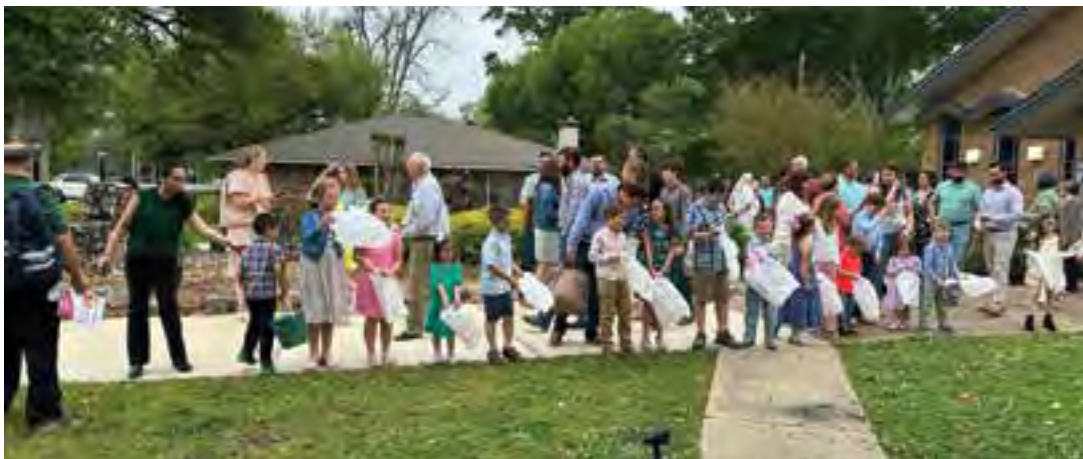
ST. FRANCIS DE SALES, ECHO. Easter Egg Hunt following Easter Sunday Mass.