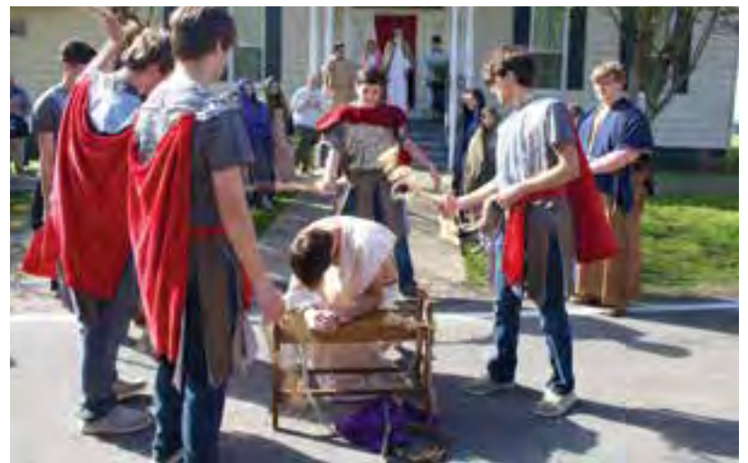
SACRED HEART SCHOOL, MOREAUVILLE. Living Stations of the Cross for 2024.