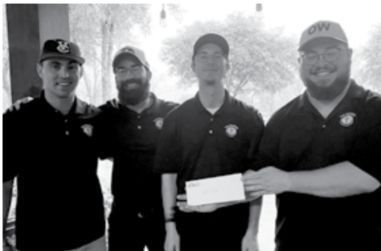
ST. RITA GOLF CLASSIC. Nineteen teams participated in the St. Rita Golf Classic on Monday, April 8. Though the weather didn't cooperate for us to finish – only 4 rounds of golf were played – everyone still had a great time! “The Padres” were one of the teams that won! Proceeds from this event benefitted the St. Rita Church Youth program.