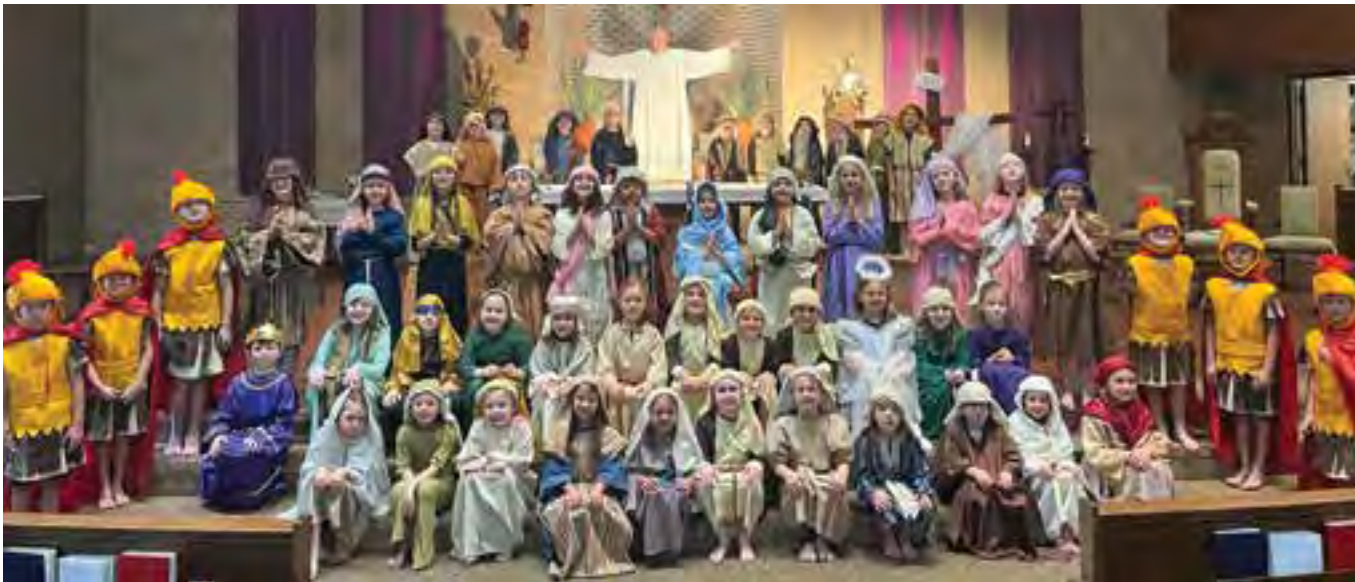
OLPS SCHOOL ANNUAL PASSION PLAY. Our Lady of Prompt Succor School's First graders performed the Passion Play during Holy Week. From the Last Supper to Jesus rising from the grave, our students sang their hearts out, filling the church with such sweet voices. Proud to carry on this cherished tradition at Our Lady of Prompt Succor School!

See more photos from across the diocese at www.diocesealex.org/our-diocese/all-photo-galleries/