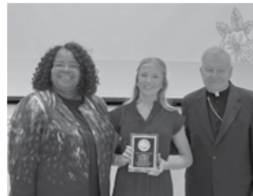
(above) DIOCESAN QUIZ BOWL WINNERS. The annual Diocesan Quiz Bowl (bible knowledge competition for Jr. High students) was held on Saturday, March 23 at St. Frances Cabrini School in Alexandria. Six teams from across the diocese competed this year. Congratulations to the 1st place team, Our Lady of Lourdes Church, Winnfield and 2nd place team Holy Savior Menard.