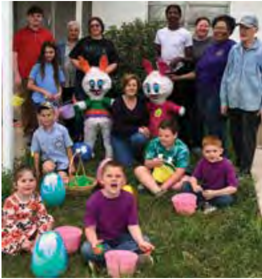
NATIVITY OF THE BLESSED VIRGIN MARY CHURCH IN CAMPTI held its annual CCD youth Easter egg hunt and celebration.