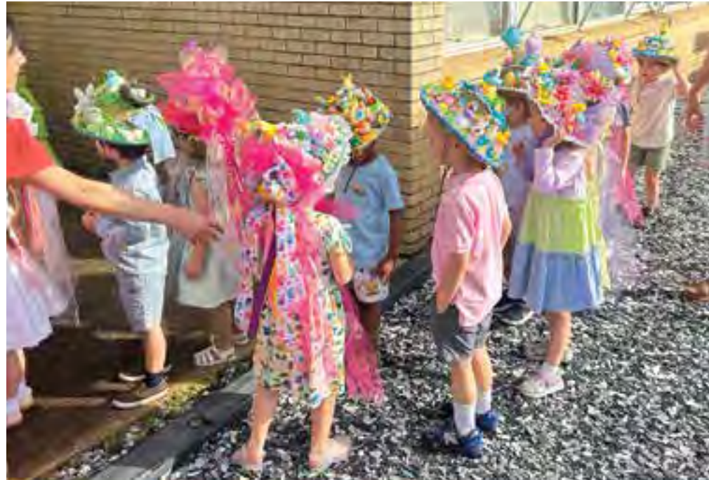
OUR LADY OF PROMPT SUCCOR SCHOOL. During the Preschool Easter Bonnet Parade the little ones strutted their stuff in their Easter best and most fabulous bonnets, followed by a fun Easter egg hunt and some family fellowship!