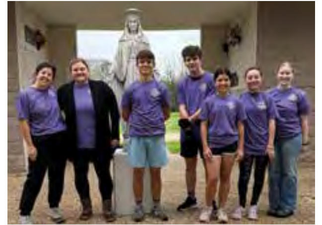
(above and below) ST. MARY'S YOUTH GROUP SEASON OF SERVICE spent several days cleaning up the church parish cemeteries.