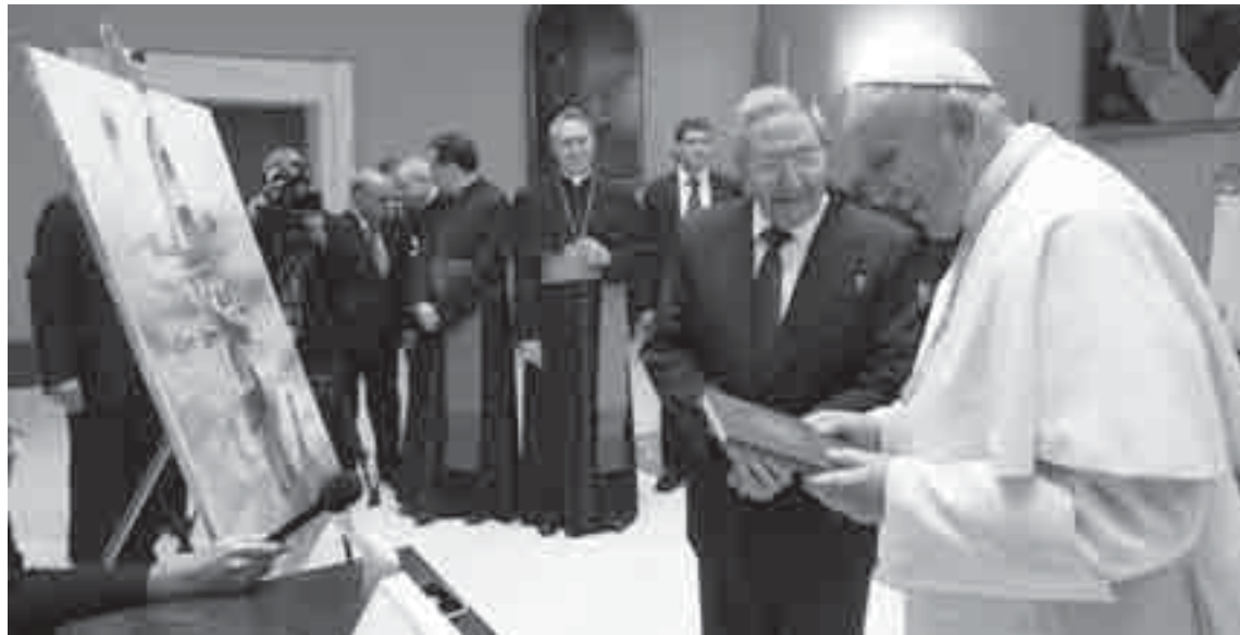
POPE FRANCIS EXCHANGES GIFTS WITH CUBAN PRESIDENT RAUL CASTRO during a private audience at the Vatican May 10. The painting shows a cross made up of migrants' boats with a migrant kneeling before it in prayer. Castro gave the painting to the pope.

"I read all the speeches of the pope," Castro said, and he told reporters that he already had told Renzi, "if the pope continues to speak this way, sooner or later I