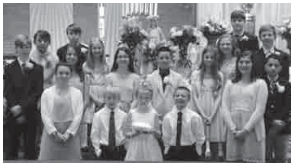
OUR LADY OF PROMPT SUCCOR MAY CROWNING was held on Friday, May 1.