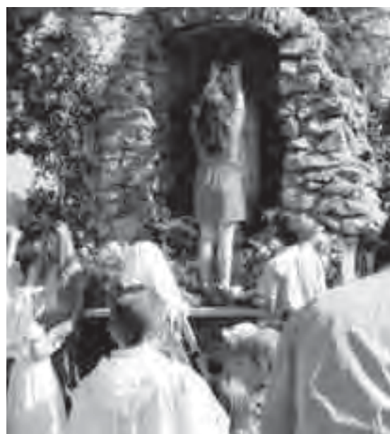
SACRED HEART SCHOOL (Moreauville) MAY CROWNING. Eighth grader [name] was chosen to crown Mary, and the flower girl was second grader [name]