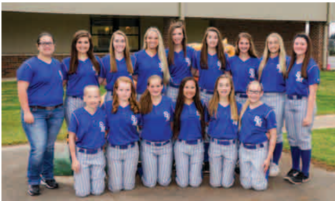
THE LADY TIGERS OF ST. MARY'S SCHOOL, Natchitoches. (Names unavailable.)

The Lady Hornets broke through with three runs in the fourth to prevent the St. Mary Tigers with any shot of winning.