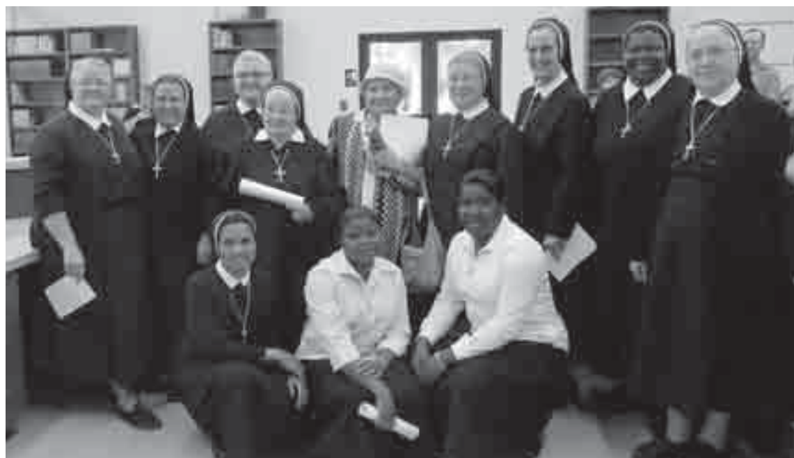
SISTERS OF OUR LADY OF SORROWS. Several sisters and novices from the order of Our Lady of Sorrows were present for the dedication.