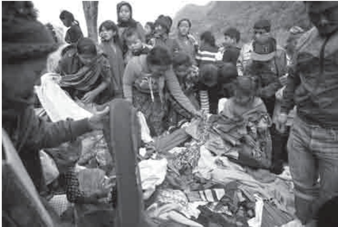
EARTHQUAKE AFTERMATH IN NEPALESE COUNTRYSIDE. Earthquake survivors select clothes from a relief material delivery near Gorkha, Nepal, May 1.

Media have been abuzz with reports that relief supplies were yet to reach hundreds of thou-