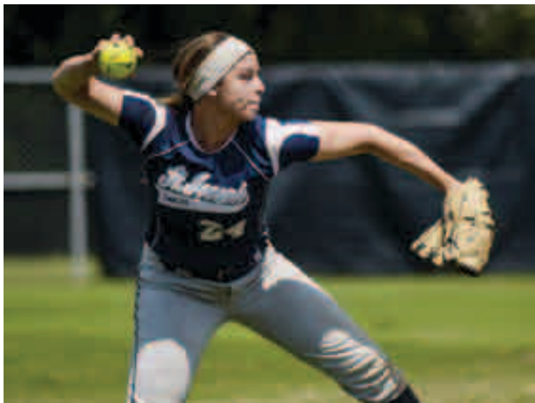
ST. JOSEPH INFIELDER (24) throws to first base for a Northside Christian during a semifinal game in the LHSAA Fast Pitch 56 State Softball Championship tournament at Frasch Park in Sulphur, LA, Saturday, May 2, 2015.