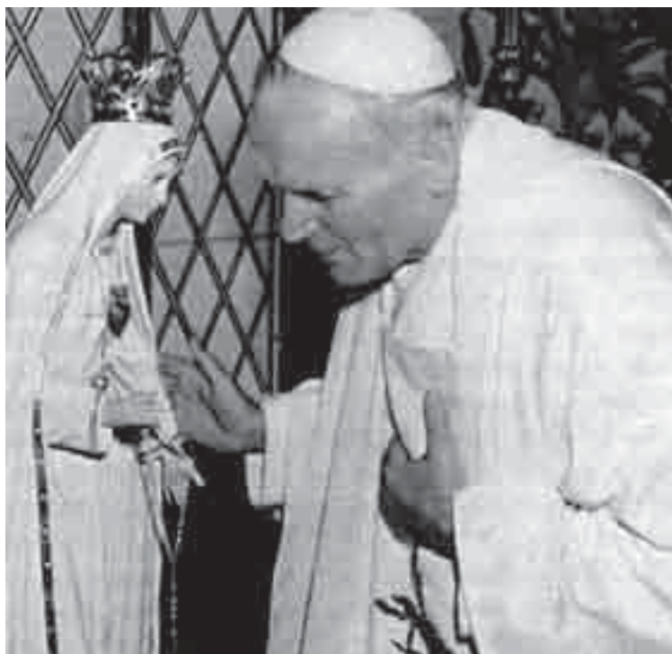
ST. POPE JOHN PAUL II touches a statue of Our Lady of Fatima while bowing in prayer. Cardinal Angelo Amato, prefect of the Congregation for Saints' Causes opened a conference May 7 on "The Message of Fatima between Charism and Prophecy."

"As Pope Francis often repeats, the church today is a church of martyrs, of those Christians who, defenseless, are killed daily out of hatred for their un-