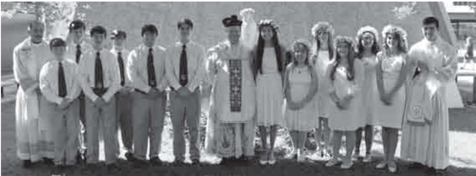
HOLY SAVIOR MENARD MAY CROWNING. Holy Savior Menard held its May Crowning May 6. Members of the Court are 9th Grade: