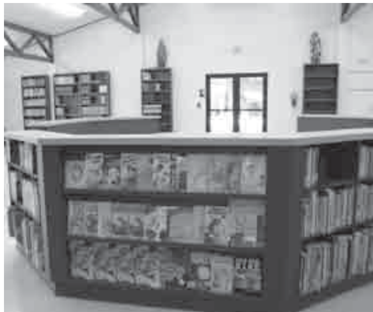
LOTS OF BOOKS and attractive displays for books line the walls and the circulation desk. The high ceilings give the center a very spacious feel.