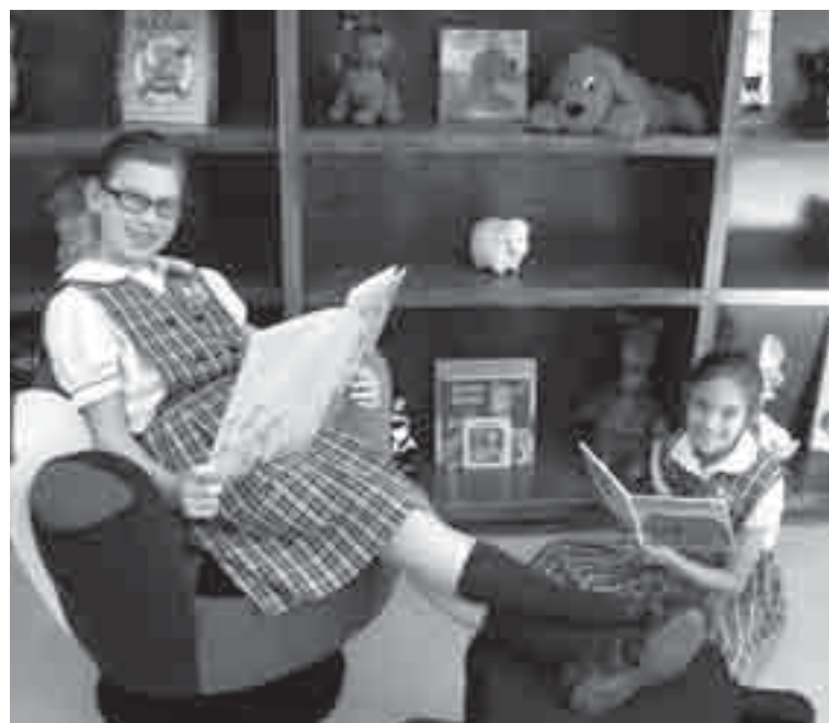
COMFORTABLE READING. make themselves comfortable in the new reading area of the library.