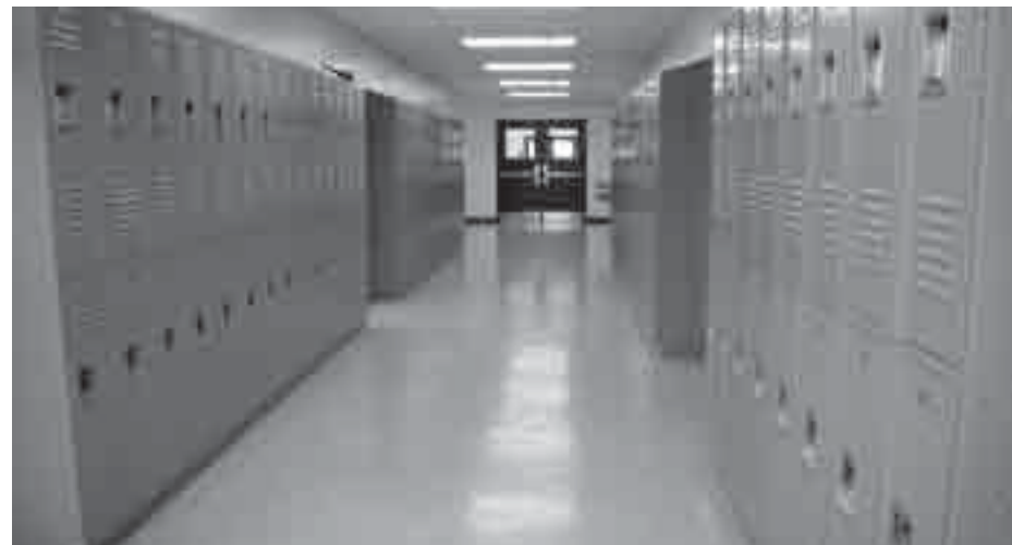
ROWS OF LOCKERS line the halls of the junior high wing.