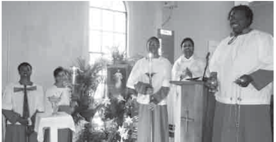
DIVINE MERCY AT HOLY GHOST CHURCH IN MARKSVILLE. Holy Ghost Catholic Church in Marksville held a Divine Mercy service on April 12 at 3 p.m.