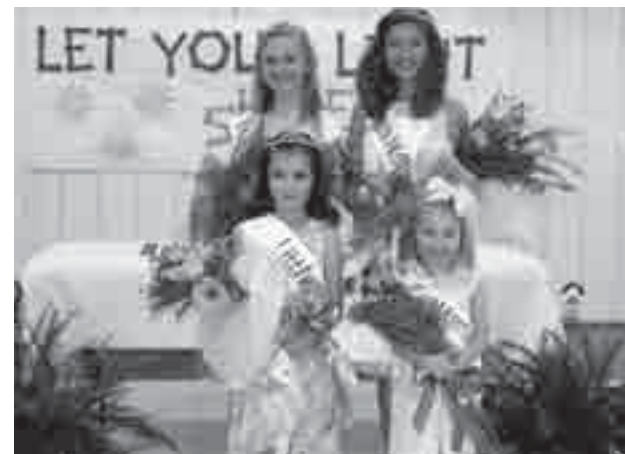
2015 ST. ANTHONY PAGEANT WINNERS.