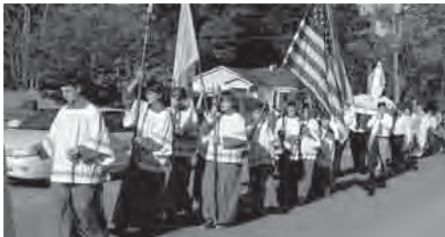
ST. ANTHONY OF PADUA SCHOOL (Bunkie) MAY CROWNING. Members of the 8th grade class participated in the May Crowning held at St. Anthony School in Bunkie. crowned Mary at the beginning of the Mass.

ALTAR SERVERS LEAD THE WAY. The Eighth boys carried Mary. As the procession began, the students of SAS followed, holding their flowers for Mary.