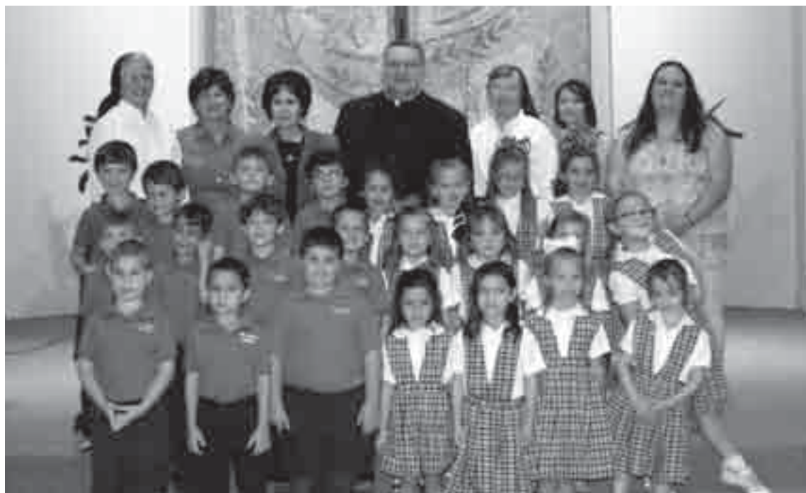
ST. ANTHONY SCHOOL KINDERGARTEN ADVANCEMENT PROGRAM.

WINNERS OF THE EDUCATIONAL CONTEST sponsored by the Catholic Daughters Court Padre Pio #2141 of Cottonport were announced at St. Mary's School Mass. The theme was “Love Your Neighbor as Yourself”.