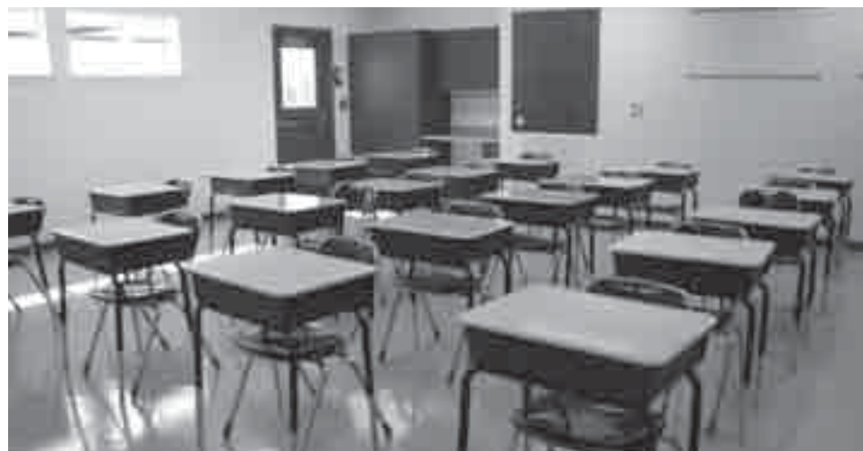
FOUR CLASSROOMS -- two for 7th grade and two for 8th grade -- are included in the junior high section.