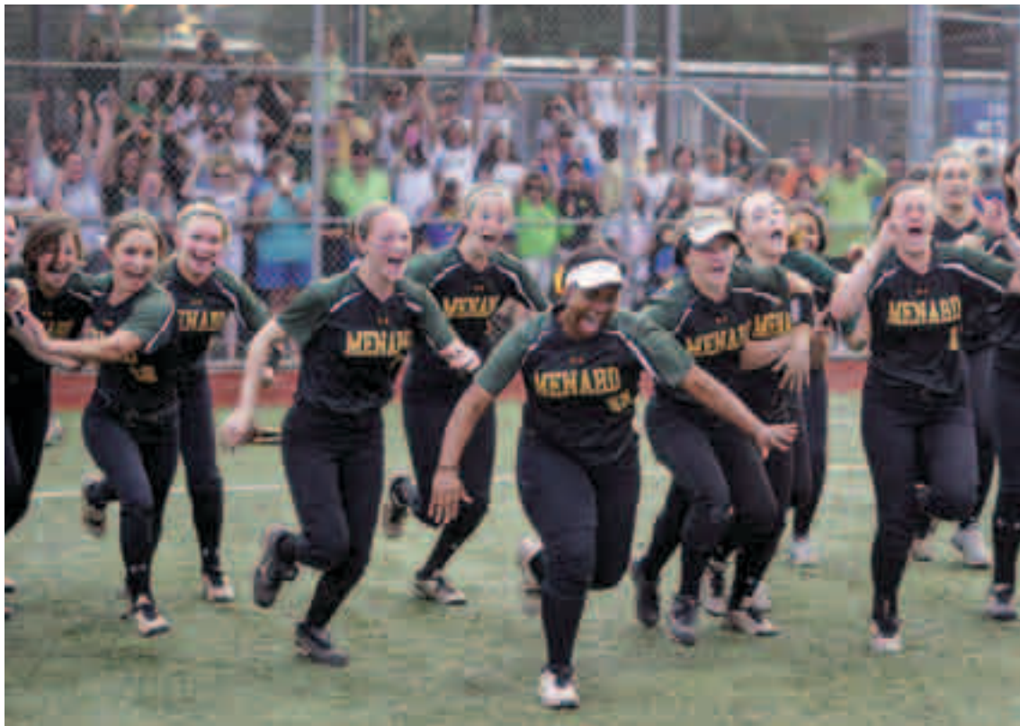
THE HOLY SAVIOR MENARD LADY EAGLES rush the field after defeating Winnfield to win the Class 2A State Championship in the LHSAA Fast Pitch 56 State Softball Championship tournament at Frasch Park in Sulphur, LA, Saturday, May 2, 2015.

Menard sophomore , struck out 10 batters