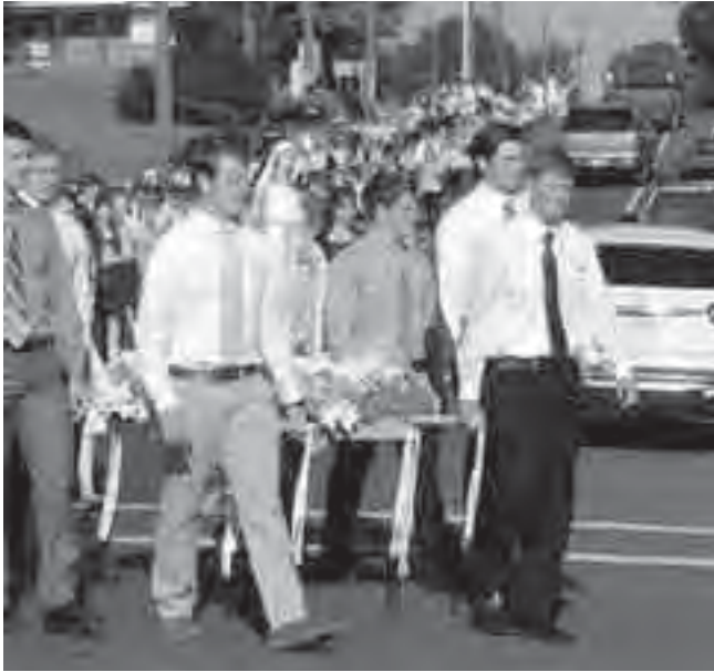
ST. MARY'S SCHOOL (Natchitoches) MAY CROWNING. St. Mary's seniors led the May Crowning procession through the streets of Natchitoches May 1. Members of the court are (front) 2nd graders