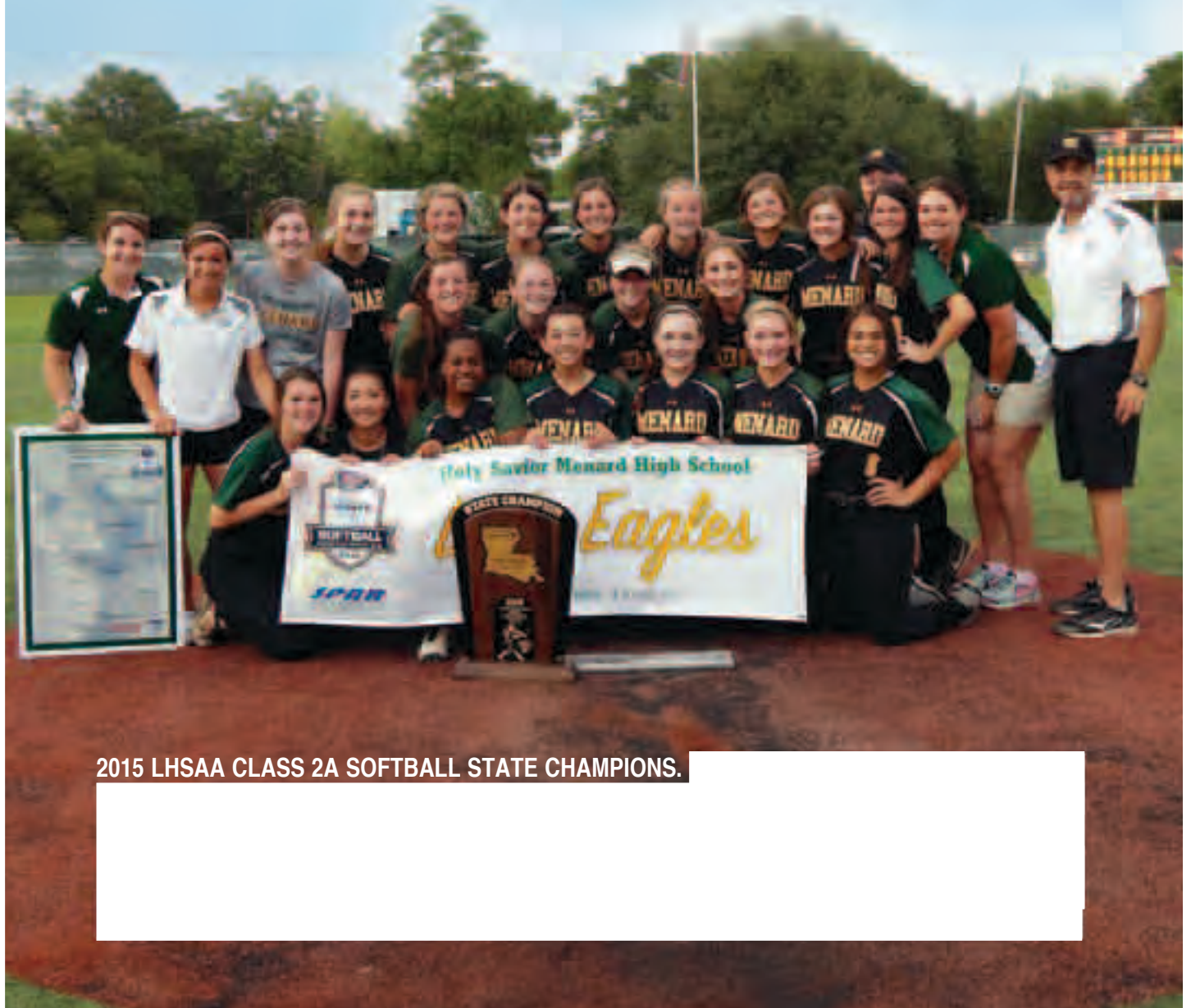
2015 LHSAA CLASS 2A SOFTBALL STATE CHAMPIONS.