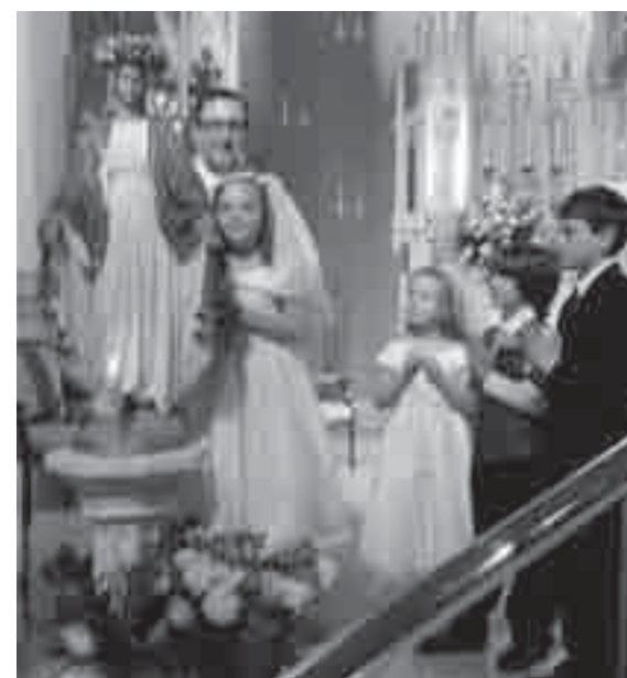
ST. FRANCIS XAVIER CATHEDRAL MAY CROWNING. Participating in the May Crowning at St. Francis Xavier Cathedral May 3