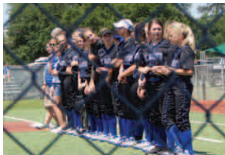
THE ST. MARY'S LADY TIGERS line up on the baseline before the start of the quarterfinal game against Pointe Coupee May 1. The Lady Tigers lost in the first game, 7-0.