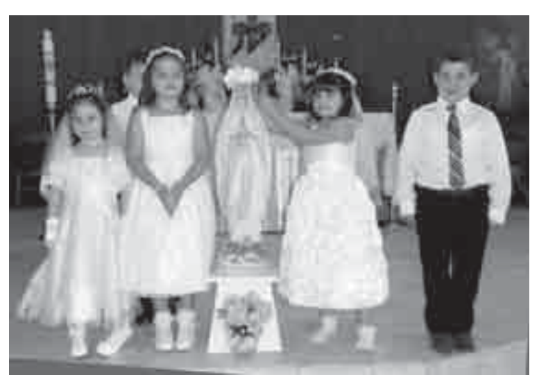
OUR LADY OF LOURDES (Fifth Ward) MAY CROWNING. Our Lady of Lourdes Church in Fifth Ward celebrated May Crowning on May 3. The First Communion