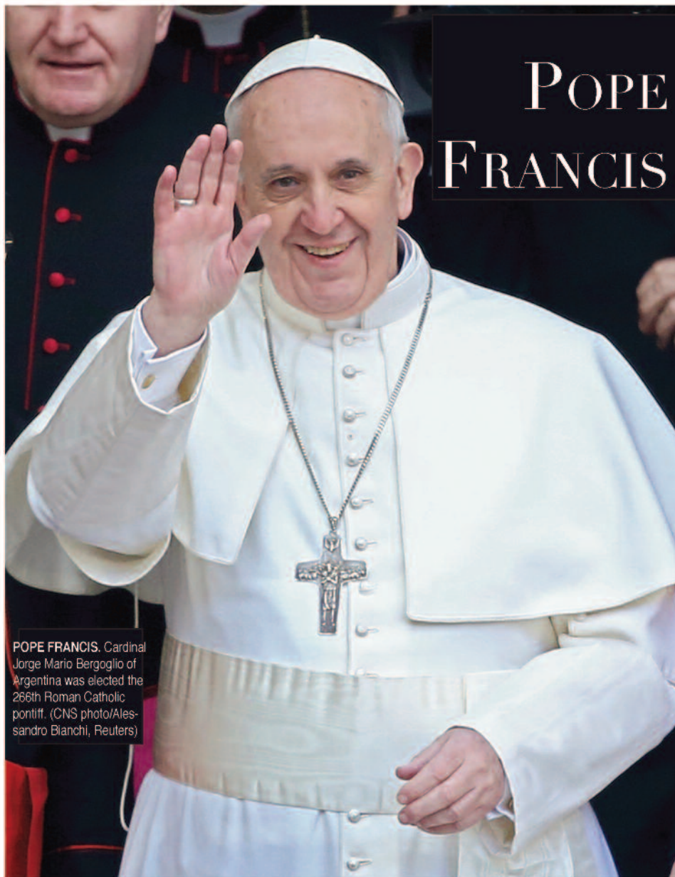
POPE FRANCIS. Cardinal Jorge Mario Bergoglio of Argentina was elected the 266th Roman Catholic pontiff.