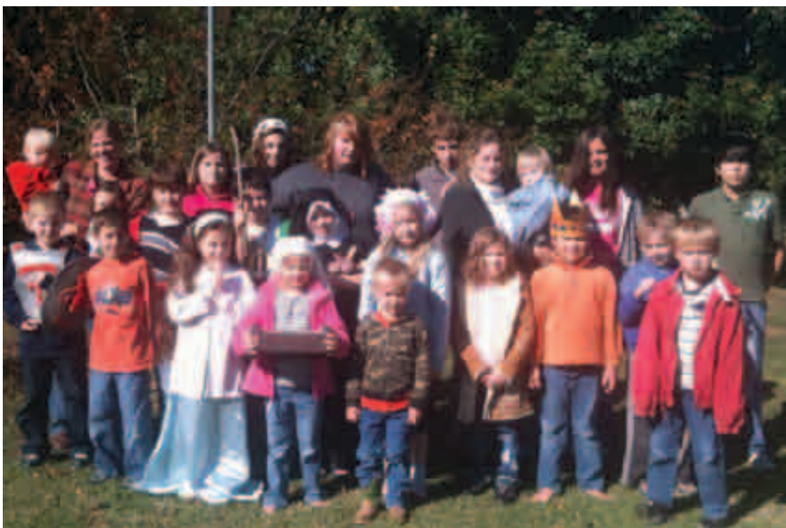
CATHOLIC HOMESCHOOL SAINTS. Local Homeschool families celebrated "All Saints Day" with a show and tell guessing game of their chosen saint and bible hero. They also played carnival-type games including 3-legged races, sack-races, and apple bobbing for the big kids and bean bag toss, ping-pong target games, find hidden toys in the mystery mixture and in the sand box for the younger children. The day concluded with jambalaya for lunch and wonderful homemade sweet treats. If you are interested in homeschooling or would like to join us for our next event, please contact Sandra West at 442-9042.