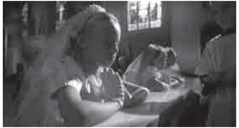
NATIONAL CATHOLIC TV AD. This is a screen grab, filmed in St. Mary's Basilica in Phoenix, from one of the Catholics Come Home television spots which aired last year. An estimated 92,000 inactive Catholics have come back to the church in the diocese in large part because of the campaign.

"If you've been away, come home to your parish, and visit