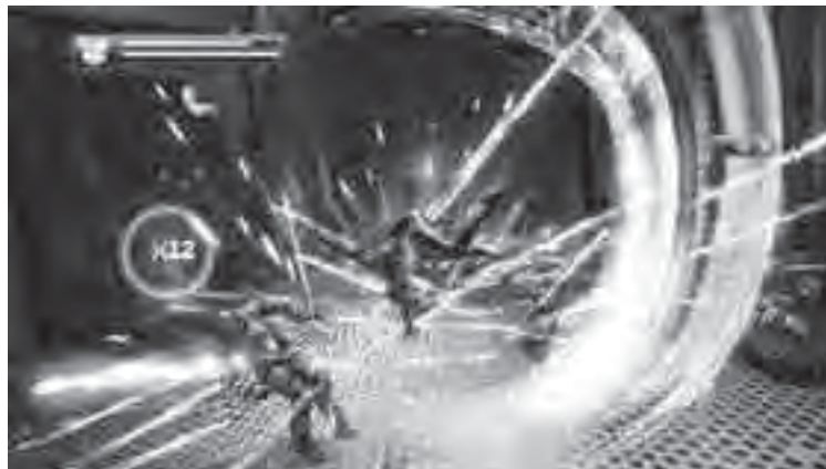
SPIDERMAN: EDGE OF TIME is rated A-II (Adults and Adolescents) by the Catholic News Service and T (Teens) by the Entertainment Software Rating Board

O'Hara must communicate and work with Parker to stop this fatal vision from coming to pass. Their respective alternate