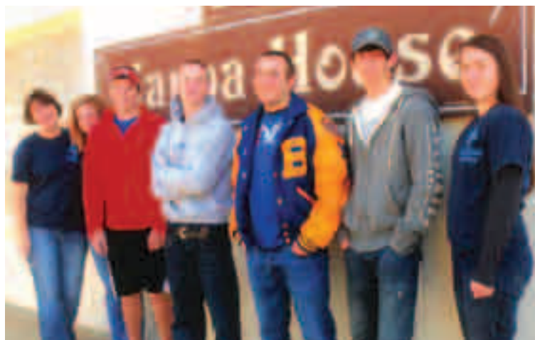
ST. FRANCIS & ANNE (Kolin) YOUTH GROUP DELIVERS FOOD TO MANNA HOUSE. Members of the Sts. Francis & Anne Catholic Church youth group and the Catholic Daughters delivered 100 lbs of dried beans, 92 lbs of rice, 20+ lbs of pasta and 5 lbs of cornmeal to Manna House on Nov. 11. All of the items were donated by members of the church parish. Pictured are