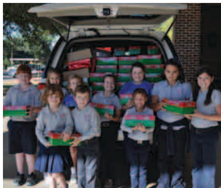
SAINT MARY'S (Natchitoches) FBLA AND 4H members participated in the Operation Christmas Child program. Specially designed Christmas shoe boxes were filled with personal items, clothes, books, and small toys and will be delivered to needy children throughout the world. Pictured are