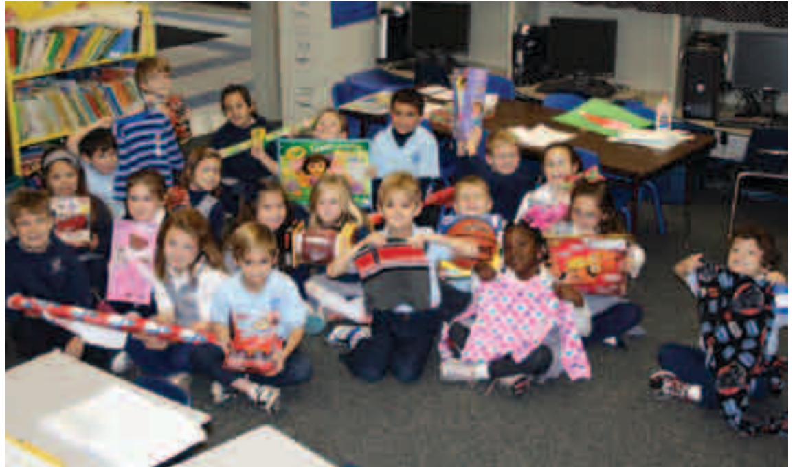
OLPS SCHOOL (Alexandria) COMPLETES ADVENT PROJECTS. Rather than exchanging gifts among themselves, the students of OLPS School choose and participated in a special project to serve or assist those in need during the Christmas season. This is a wonderful opportunity for the children to learn the gift of giving, volunteerism and that there are those in our community that are not as fortunate as themselves. The students will raise funds for each program themselves by saving & doing small chores at home.