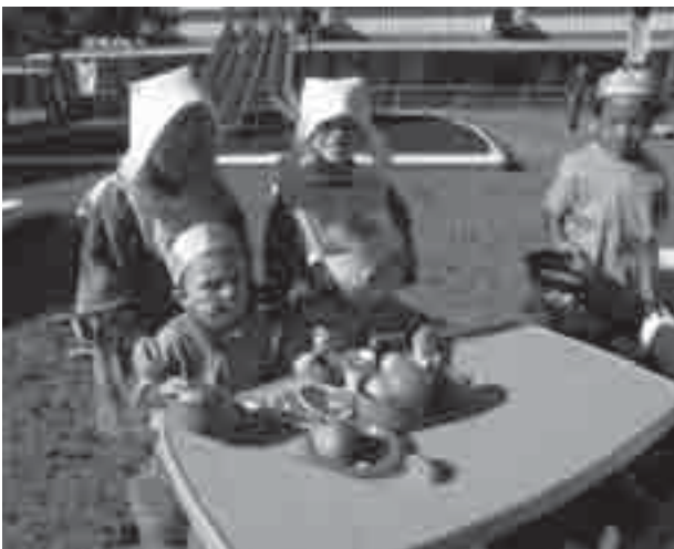
THANKSGIVING AT ST. FRANCES CABRINI SCHOOL. Students at Cabrini School dressed as pilgrims and Indians for Thanksgiving.