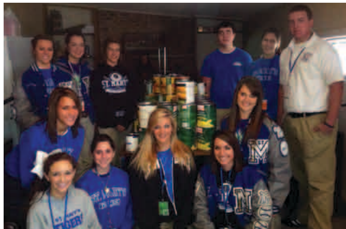
SAINT MARY'S SCHOOL (Natchitoches) COLLECTS FOOD FOR IMMACULATE CONCEPTION FOOD PANTRY. Members of the SMS National Honor Society, along with Saint Mary's students, collected and delivered food items to the Immaculate Conception Church Food Pantry. Pictured in the front row are