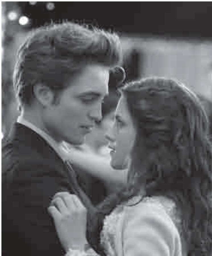
IS IT TRUE LOVE? Robert Pattinson and Kristen Stewart star in a scene from the movie The Twilight Saga. But is the forbidden, sacrificial love in Twilight really true love? God has much higher standards for love that is not based on feelings.

God has much higher standards. Its standard for love is far above The Bachelor and Entertainment Tonight and even goes beyond The Twilight Saga . To grasp God's concept of love,